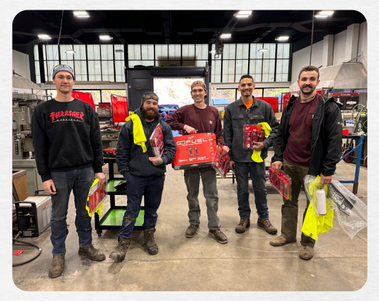
The local craft competitors happily showing off their prizes.