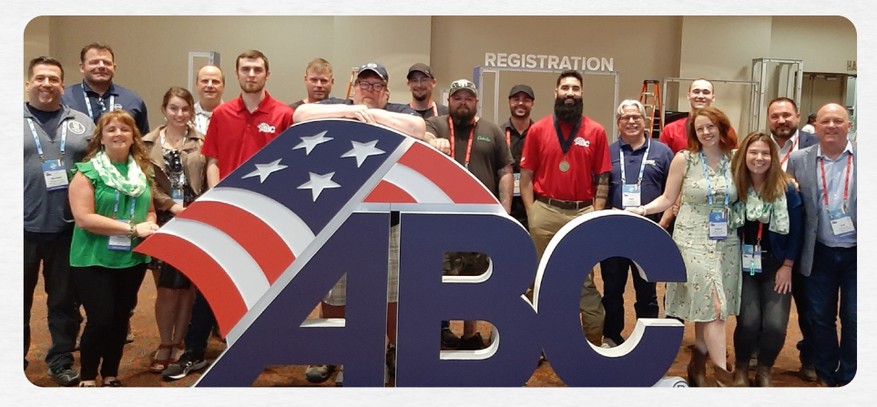
The ABC MA team celebrating after the awards ceremony at the 2022 National Craft Championship.

ABC presents the Local and National Craft Championships each year to highlight the achievements of the people who represent the future of the construction industry. Craft trainees and apprentices compete locally, travel from across the country to demonstrate their superior skills, training and safe work practices, and to compete for top honors in their chosen craft.