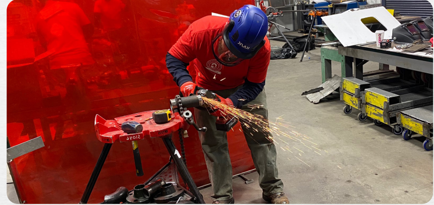
A competitor hard at work displaying craftsmanship and precision.

For more information, visit/contact: www.abc.org/Workforce/NCC