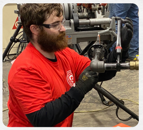
A local competitor focused intently on his task.