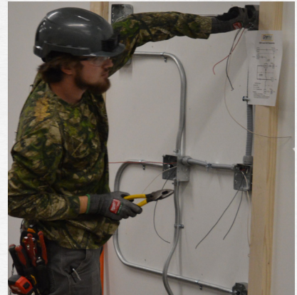
A local competitor focused intently on his task.