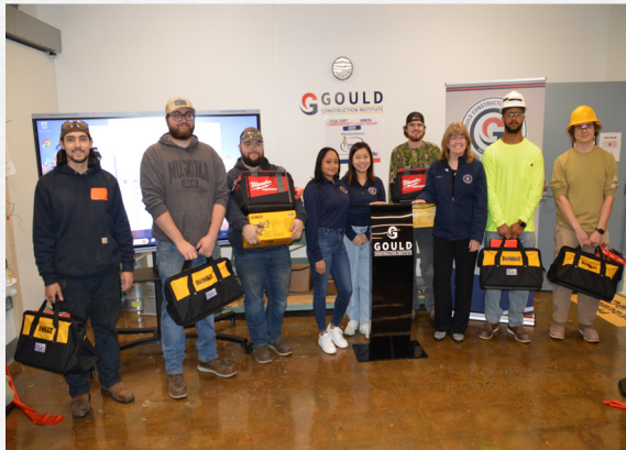
The local craft competitors happily showing off their prizes.