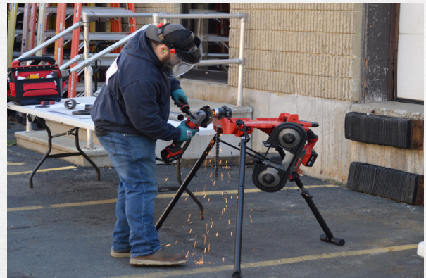
A competitor hard at work displaying craftsmanship and precision.