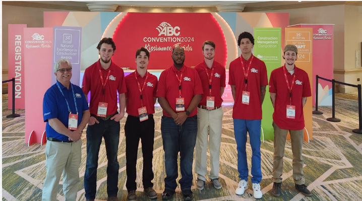
The ABC MA team celebrating after the awards ceremony at the 2024 National Craft Championship.

ABC presents the Local and National Craft Championships each year to highlight the achievements of the people who represent the future of the construction industry. Craft trainees and apprentices compete locally, travel from across the country to demonstrate their superior skills, training and safe work practices, and to compete for top honors in their chosen craft.